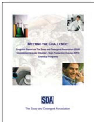
A decade of research on HPV chemicals was captured in Meeting the Challenge.