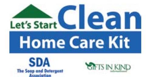
"Let's Start Clean" In 2008, SDA partnered with Gifts in Kind International to create 5,000 "Let's Start Clean" Home Care Kits for those in need. The kits contain cleaning supplies donated by SDA members, as well educational materials. So far, SDA members have donated more than $140,000 in cleaning products.