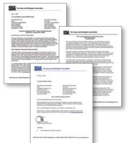
SDA testified across the country urging lawmakers to take a flexible approach to environmentally preferable procurement policies.

"WORKING WITH CALIFORNIA REGULATORS, WE NEGOTIATED VOC LIMITS THAT MAINTAINED REASONABLE, ALLOWABLE FRAGRANCE LEVELS FOR DRYER SHEETS."