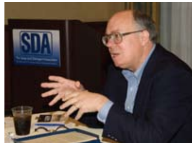
Joe Simitian, California State Senator (D), met with executives from SDA member companies during the 2009 SDA Convention. The Senator and SDA members shared an important dialogue on ingredient communications issues and legislation, which is a keen interest of Sen. Simitian.

Companies large and small helped shape a voluntary Consumer Product Ingredient Communication Initiative that originated at SDA. SDA collaborated with our allied associations in the U.S. and Canada to broaden the reach of our program. The announcement of this program, which will take effect in January 2010, enhances our ability to protect your valuable intellectual property by preventing unnecessary and potentially unfavorable legislation, while providing consumers with more information than ever before on cleaning products and their ingredients in a meaningful and consistent way.