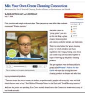
Major broadcast, print and online media regularly turn to SDA for perspective on the safe, proper and beneficial use of cleaning products, including ABC's Good Morning America (above) and CBSNews.com (below).